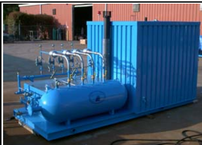
WB-450/HVS-40 with Enlarged Control Room / Maintenance House

For Options, Accessories and Spare Parts for Water Bath Vaporizers, please refer to price list "Water Bath LPG Vaporizers".